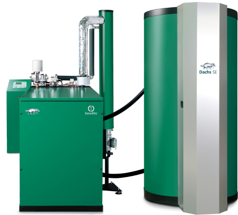
The Dachs SE Condensing Packaged System